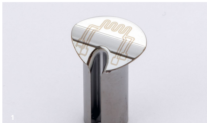
Sensor insert coated with thin-film sensors.

The measuring principle of the sensor is based on a wear-resistant thermoresistive thin-film system, which is deposited on the head of the measuring funnel. A chromium layer with a thickness of 250 nm is deposited on an insulating base coating consisting of an aluminum oxide layer ( \text{Al}_2\text{O}_3 ) with a thickness of approx. 4 \mu\text{m} . In a second step, a sensor structure is arranged in a meandering pattern on the measuring funnel by means of photolithography and subsequent wet-chemical etching. The meandering structure is thereby positioned on the horizontal funnel surface, which is in direct contact with the workpiece. The conductor paths for reading out the sensor in four-wire technology are led via a curvature into a chamfered, unloaded contact area. For the cable routing, a channel is recessed into the neck of the funnel. Finally, the thin-film sensor is provided with a second \text{Al}_2\text{O}_3 layer of approx. 3 \mu\text{m} in thickness, which protects the sensor from wear.