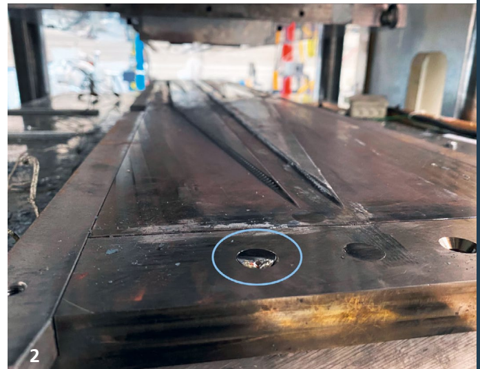
Flat-die tool with integrated sensor insert. 1

These results were achieved in collaboration with the IPH within the framework of the project “Inkrementelle Umformung hybrider Halbzeuge mittels Querkeilwalzen” (Incremental forming of hybrid semi-finished products by means of cross-wedge rolling) (SFB 1153 – Sub-project B1 – Querkeilwalzen), funded by the Deutsche Forschungsgesellschaft (German research association).